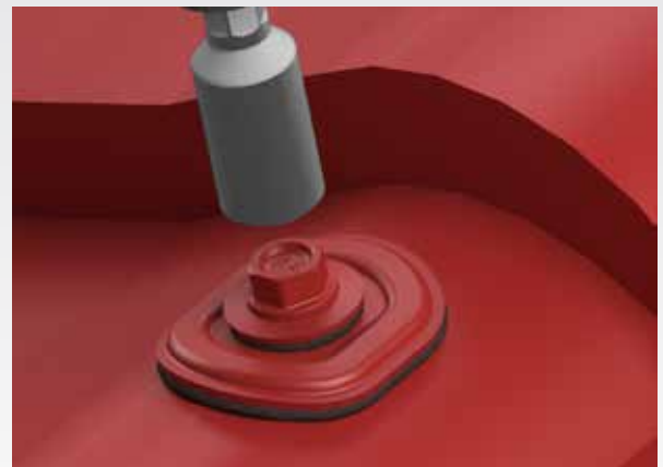
4. Perfect and stable position