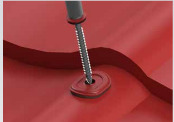
2. Screw in the screw through the saddle washer