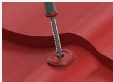
2. Screwing in through the hole in the mini saddle washer