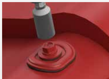
4. Perfect and stable fit