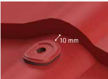
1. Putting on as drilling template

Perfect fastening with mini saddle washer